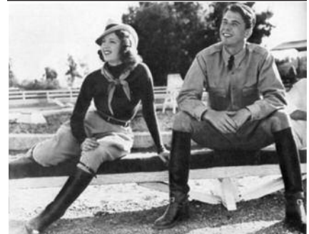
They included Ronald Reagan

She was "The Ultimate Movie Star." Her lovers included every man that mattered in Hollywood.