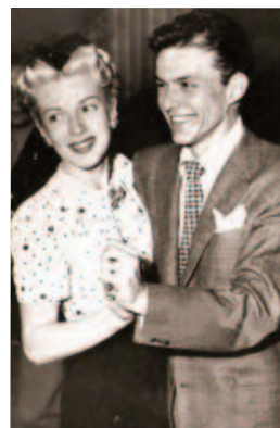
and Frank Sinatra