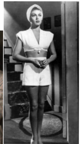
Lana, sexbomb goddess of film noir